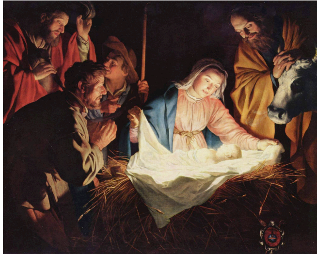
(The Adoration of the Shepherds, Gerard van Honthorst, 1590–1656, Public Domain)

Before I became a wordsmith of The Word, I really didn't have a clue who Jesus was. Even now, I continue to get divine revelation to know Him more and know more about Him. As you pray in the Holy Spirit and read the Bible, you will be amazed at what all He can teach you, whether you've been born again decades or a fraction of a day.